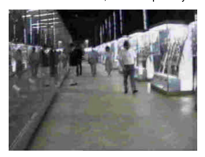
Vauban Hall, also called Detaille Hall.

While many visitors to the complex opt to go directly to Napoleon's Tomb, I have come here today with the chief goal of inspecting the somewhat less popular collection of military artifacts housed in the outstanding Army Museum collection. The collection is vast, and while the presence of the Emperor's remains overshadows the museum as Napoleon's personage did to so many things in life, it is nonetheless a remarkable point of interest in its own right. The exhibition area occupies some seven thousand square feet and encompasses roughly sixty thousand individual display articles. Included here is one of the most comprehensive assortment of artillery pieces and uniforms in the world, and indisputably the most complete collection of French