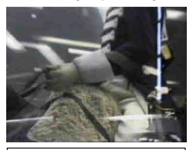
Close-up of mounted cavalry display. Detallie

Ascending the stairs to the second floor of the west refectory building, one enters guite another era; an historical epoch much closer to the one in which we live. Here in space originally used as dormitories for aging invalid war veterans, are collections of military artifacts from the two World Wars. The first of these collections is the 1914-1918 War Gallery. The gallery's three sections each display artifacts from different phases of the conflict. Not to be missed in this gallery is the bugle used to sound the Armistice which officially