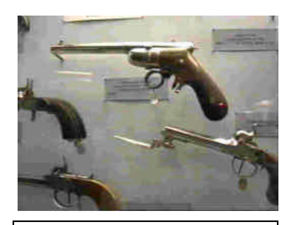
Detail of pistol display showing bayonet gun.

of special interest as well as bullets and bullet manufacturing displays