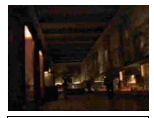
Dimly lit Colors and Standards Hall (Turenne Hall.)

Proceeding through the topiary garden and entering through a ponderous pair of doors guarded by a second gendarme, one reaches the spacious main courtyard paved in octagonal cobblestones known as the Cour d'honneur. If one finds the presence