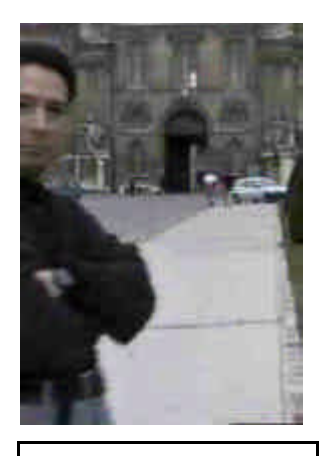
At Invalides' entrance.

Here, on the ramparts, are seventeenth and eighteenth century artillery pieces bearing a verdigris patina. The canons, removed by the invading Germans in 1940 and restored after the French Liberation, flank Invalides' main gate. The