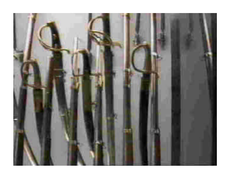
Swords behind glass display case in Detaille Hall.

Nearby, hangs a portrait of Napoleon at Fontainebleau very different