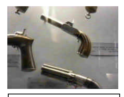
Derringer and multibarrel (five barrel) pistol.

showing the evolution of ammunition from 1863 through to the present day.