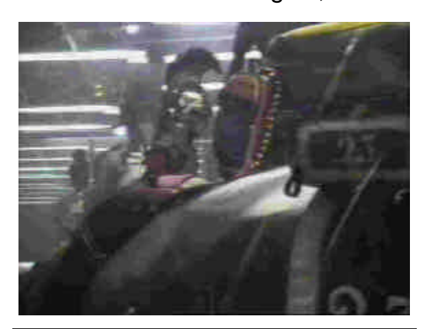
Detaille Hall. One of many mounted cavalry

On the left wall of the chamber, softly illuminated, hangs a large portrait of Napoleon I in coronation dress seated on the Imperial Throne of France in 1804 and rendered by Dominique Ingres in 1806. Resplendent in robes of state, his head wreathed with the laurels of a Caesar, the newly crowned Emperor has here assumed the trappings of a demigod, perhaps not yet suspecting that he would in time suffer a fate similar to that of his counterparts of Imperial Rome. Walking back through the lobby occupied with such somber thoughts, one crosses into the left wing of the former